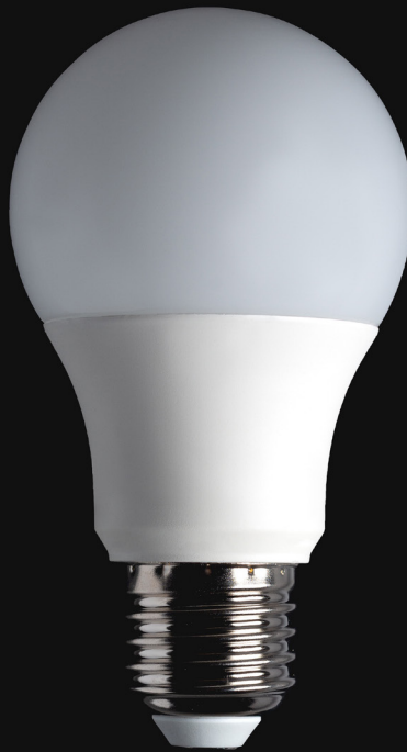
Light Emitting Diode (LED)